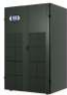
Online UPS 0.5 KVA to 200 KVA