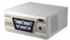
Domestic Inverters 03 KVA to 10 KVA