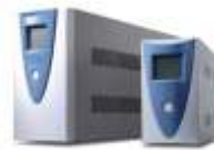
Offline UPS for PC 0.5 KVA to 2 KVA